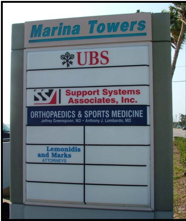
Monument Signage on US 1