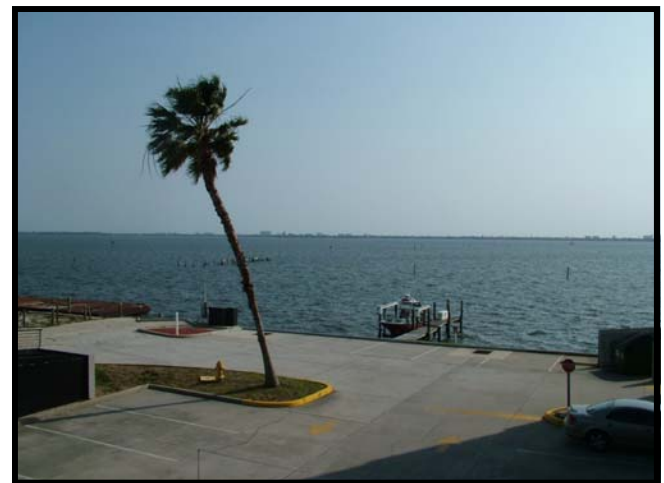
River view from parking level