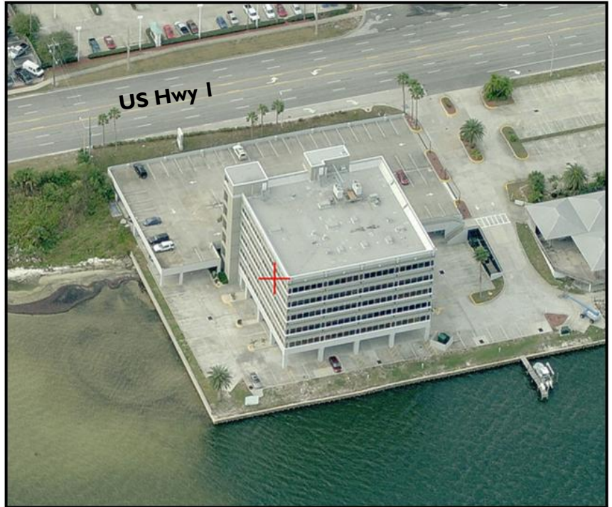
Conveniently situated on US 1 with river views creating a pleasurable work atmosphere